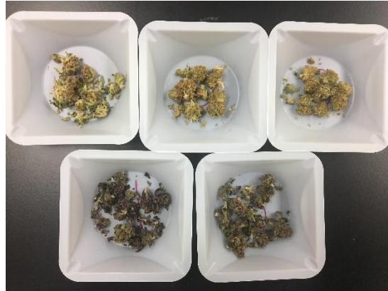
Figure 1. Cannabis strains used (clockwise from top left): Agent Orange, Tahoe OG, Blue Skunk, Grand Daddy and Grape Drink